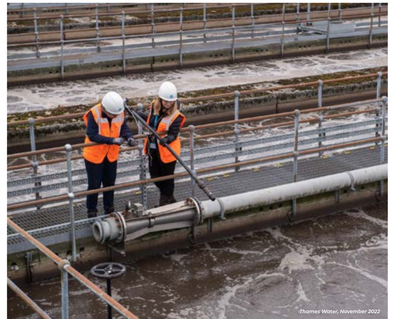
Thames Water, November 2022

Engineers at a wastewater treatment site collecting a test sample