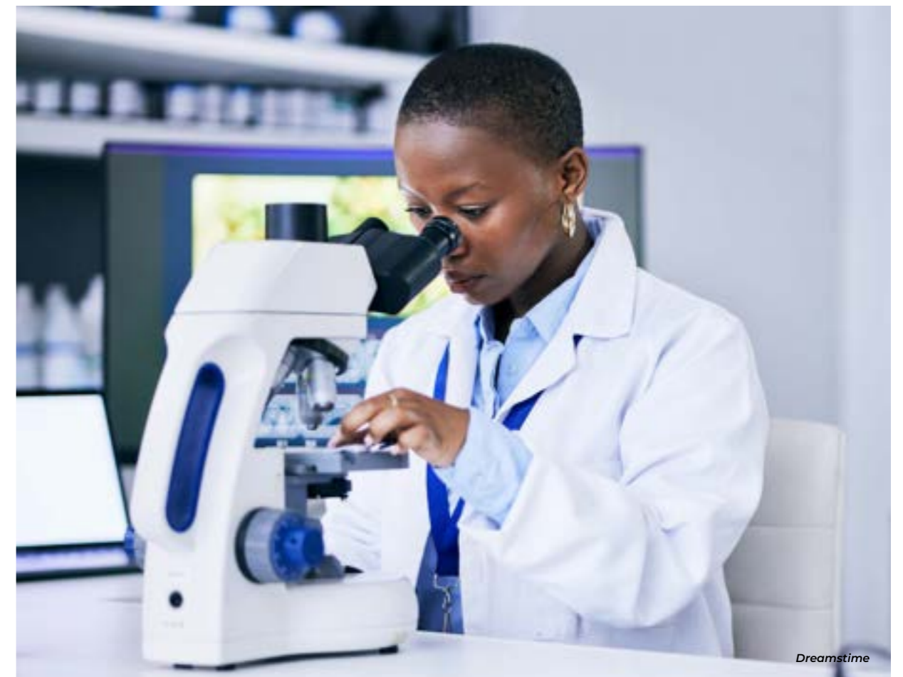
Scientist using a microscope

Not ready to commit to an industry placement? Consider speaking to your local T Level Science provider about giving a talk about your organisation or hosting a site visit. This is valuable to students and gives you an insight into their skills and coursework with minimal commitment.